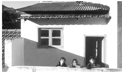
The Olive Trees of Justice