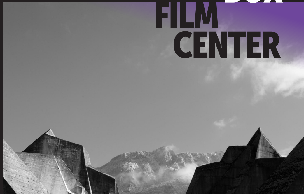
Still from Jóhann Jóhannsson's Last and First Men