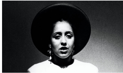
I Am A Cliché